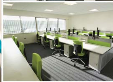
All pictures are from our general UK portfolio